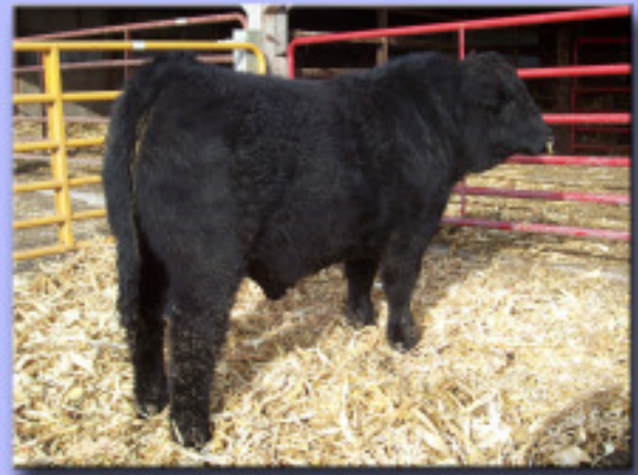
GA Invasion Y119 - Lot 23