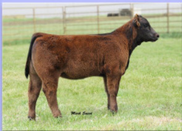
GA 142 - Full Sib to Pregnancy