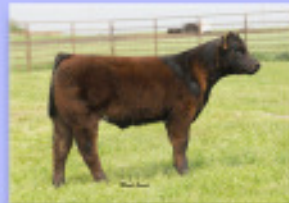
R&K 189 - Steer calf by Monopoly