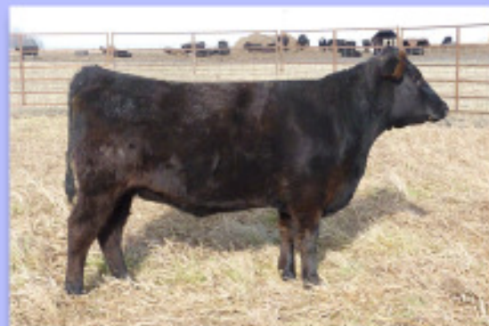
WK First Lady 0219 - Lot 88

Consignor: Golden Acres Simmental Reg. Purebred Angus Bred Hfr AAA# 16690063 Tattoo: 0219 BD: 2-7-10