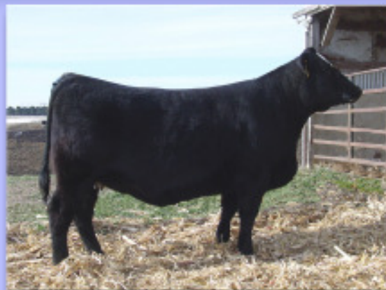
GA Miss Macho 957W - Lot 95

Since she was a baby, this baldy Macho heifer has been the deepest bodied heifer we've ever raised. Macho daughters are making excellent cows and this one has all the parts to be just that. She's very nice fronted with a lot of spring of rib, level top and hip, and excellent bone. I just can't say enough about the quality of this heifer, but you judge for yourself. I think you'll love her. No clean up bull.