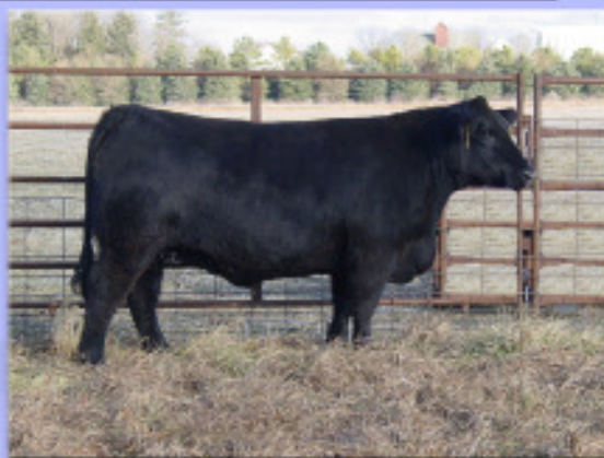
R&K Rain 903W - Lot 96

This true donor prospect is a prime example of why so many breeders are using BC Lookout on their best Simmie cows to produce outstanding F1 females. First of all, she's very eye appealing with her long neat front, her extreme depth of body, laid in shoulders, and great hip structure. She has nice bone and walks like a cat. This big topped heifer is so easy fleshing we had to run her with the mature cows this winter. We are extremely excited about her F2 calf by Grizzly. Be sure to analyze her closely. No clean up bull.