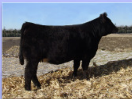
GA 905W - $7,250 Maternal Sister to 954W