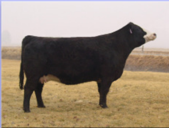
Jarrs Miss Macho 44T - Lot 41