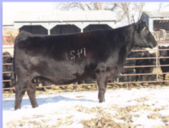
WK OK Duchess 1421- Dam of Lot 64

Miss GX 728R WK Gunsmoke PF Miss Pollard 6807 26G