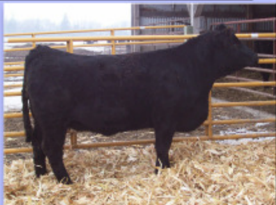
GA Chelsea 018X - Lot 59