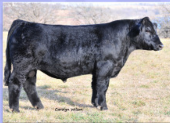
Fitz Pol Zazu Y82 - Lot 12

Zazu is an ET son of Upgrade and our Portia donor. He is homozygous black and polled. He combines calving ease, explosive growth, and fantastic maternal values along with carcass numbers that are top notch all together in an eye catching package. A flushmate, Fitz Pol Optima, was a sale feature in the first SWSG Fall Show Cattle Auction (2011). Zazu is also a maternal brother to Fitz Pol Boxcar. Boxcar is the reigning Purebred Performance King of the American Simmental Association's Carcass Merit Program. Come look up Zazu before the sale. You'll be glad you did. Adj. YW is 1513.