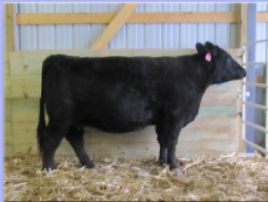
WS Ms McKenzie U18 - Lot 107

This 3/4 blood originated from the Walsh Family in Nebraska and goes back to the great Paralyzing Eyes cow. She has 3 generations behind her of class winners in Denver. Mated to Macho for an early January calf.