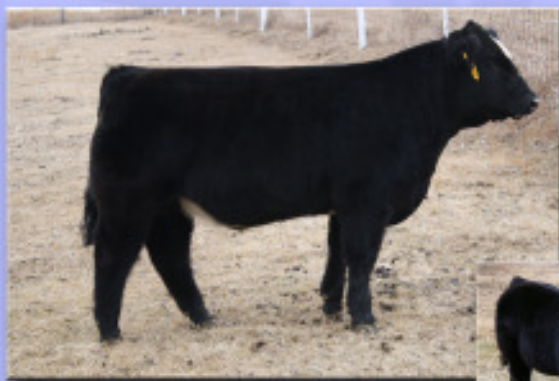
KCC Bull 60Y - Lot 32

Everyone needs to look at this bull. This bull is a thick made, deep sided, level wide topped, big butted, walks well, attractive Grandmaster son. He is solid black. There is no Dream On or Meyer 734 in his pedigree, so you can use him on almost anything. His EPDs are really good with calving ease, high maternal traits, & rock solid carcass values.