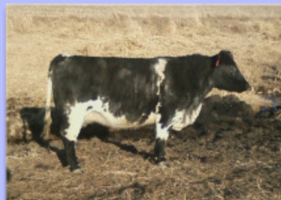
RB Chyan - Lot 111

This really cool colored cow is not easy to part with but we thought she would make a lot of friends when you see her. She has a lot of eye appeal. She's really deep ribbed, nice fronted, easy fleshing and great hipped. She's had a good calf every year with an average of $3,000 a head. She has never been flushed and I think she should be. Pasture bred to RB Stalky who sells as Lot 7.