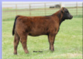
GA 142 - Heifer calf by Bojo