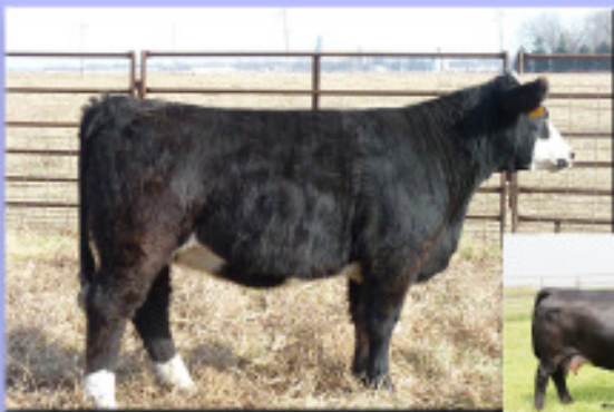
GA Ginger 068X - Lot 80

This Who Made Who daughter is out of our many time champion Ginger 534R cow. Fancy is the best way to describe her. You'll love the way she looks through the shoulder and neck plus she's level hiped and big topped with plenty of bone. She's sure the kind to raise those fancy steers and heifers. TH & PHA clean by pedigree. Full sister to Lot 80. No clean up bull.