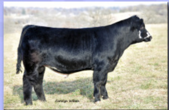
Fitz Pol Brock Y988 - Lot 26

This black brockel faced, smooth polled, huge topped, deep sided Boxcar son really puts together the total package! His actual birthweight, from his first calf heifer mother, was 78 pounds, the lowest birthweight of all our bull calves. His weaning weight of 985 pounds, was our 2nd highest. Brock combines calving ease, explosive growth, solid maternal values, & top notch carcass numbers into one of the coolest looking bulls we have ever produced. His sire, Fitz Pol Boxcar, has sired many calves in the American Simmental Association's Carcass Merit Program that have impressed those who have seen them with the quality & consistency. Come & look up Brock before the sale. You will be glad you did. Adj. YW is 1601