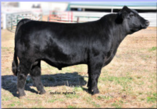
CLO/LTS Conspiracy 72X - Service Sire of Lot 90 & 91

Char is level topped, square hipped, and really deep sided. She's feminine fronted and structurally sound. I think she's got a lot of potential. You can breed her a lot of different ways. Maybe Monopoly? No clean up bull.