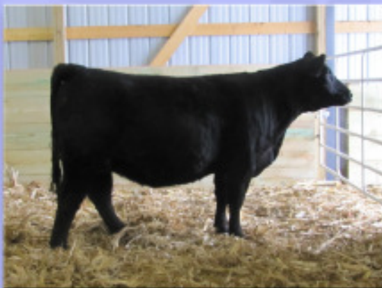
K-Lee-S W1 Callie - Lot 92