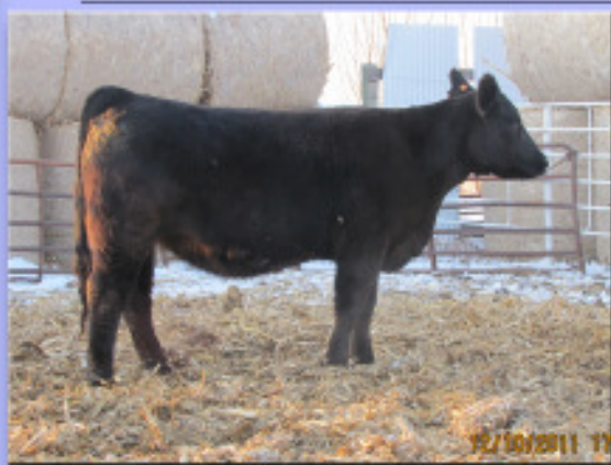
K-Lee-S X13 Madie - Lot 61

Here's a SimAngus heifer that has all the qualities we want in a halfblood female. She's a nice fronted, deep ribbed, easy fleshing and moderate framed. She's super sound and has adequate bone. She's a maternal sister to last year's high selling female and has the genetics to be a super mama cow. No clean up bull.