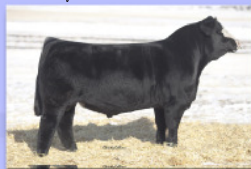
Ruby NFF Excalibur 002X - Sire of Lot 43