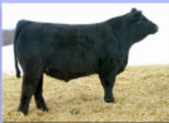
Triple C Main Event Son of Triple C American Girl by Invasion