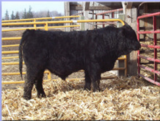
GA Masterpiece Y104 - Lot 29