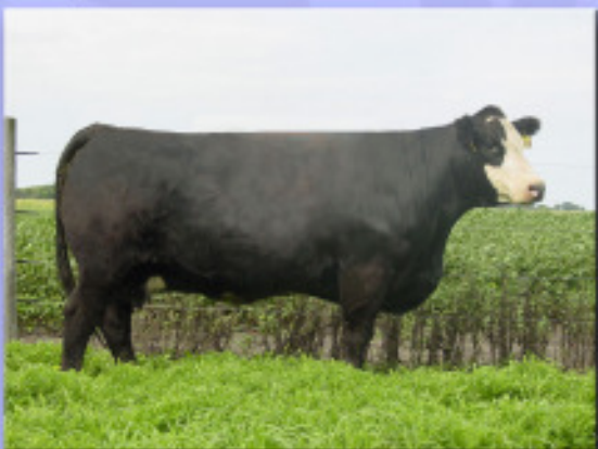
GA Chelsea H840 - Dam of Lots 81-83

Here's another baldy heifer out of our Ginger 534R donor and Who Made Who. She's definitely the front pasture kind that will raise those fancy steer and heifer calves that will put you on the map. Her socks add to her eye appeal. She's got all the right parts. Give her a second look and mark her in your catalog. Full sister to Lot 79. No clean up bull.