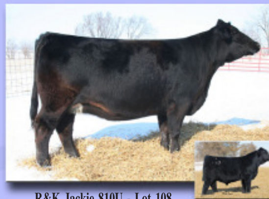
R&K Jackie 810U - Lot 108

Only because of our commitment to the quality of this sale, do we offer a female of this magnitude. Jackie is star faced, about as deep, long, & feminine as you could make one, & she could get fat on wind and water! As an added bonus she produces a ton of milk! Her Domination calf will be very special, as the Domination cattle are topping sales all over the country. Ultrasounded safe to Domination. Definite donor cow material!