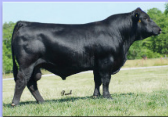
HTP SVF In Dew Time - Sire of Lot 118

Here is a heifer that gives you the opportunity to purchase into the G3 cow family. Her mother is G3 x Triple C Power Plus. Power Plus was a very high ranking carcass bull and one of the high selling bulls in Triple C's bull sale in 2004. She will make a great cow.