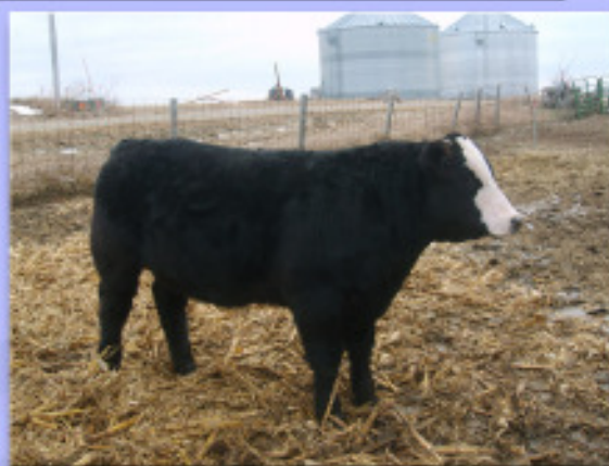
KBARM Gambler Y1 - Lot 36