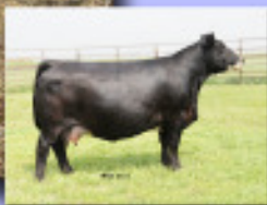
GA Ginger 534R - Dam of Lot 79