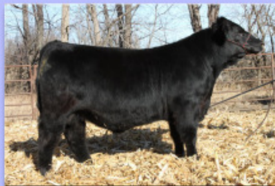
LBS Meyer Special 114Y - Lot 35