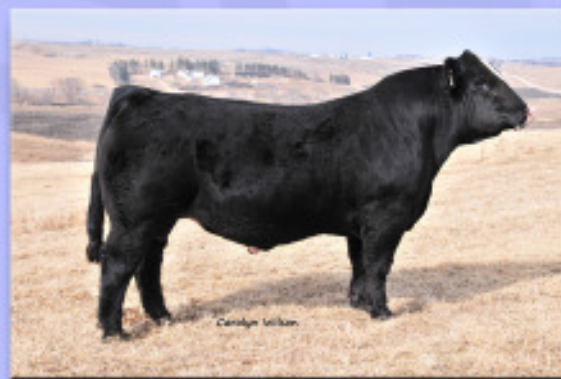
VSF Static 8102U - Sire of Lot 37