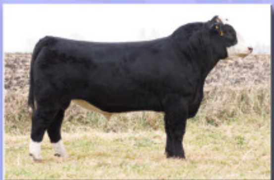
LBS Meyer Beauty 811U - Sire of Lot 71

This star faced Macho daughter is definitely the right kind. She's big volumed with a very feminine front. Her donor dam Emblazon 433 has been a top producer of fancy heifers. My granddaughter will be showing a really nice full sister to 011X this show season. Don't miss the opportunity to own one of these females. Full sister to Lot 69. No clean up bull.