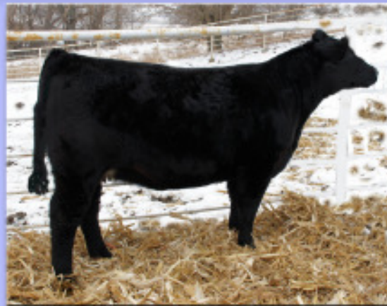
Juncks 222X - Lot 84

Consignor: Juncks Simmental - Dave Junck Polled Crossbred Bred Hfr ASA# NA Tattoo: 222X BD: 4-1-10