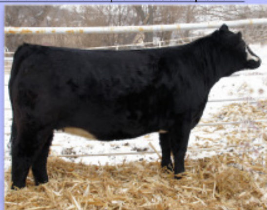
Juncks 59X - Lot 57

Juncks 59X is a speckled faced purebred heifer that we had in our 2010 show string as a heifer calf, bred to the popular ABS sire Movin Forward. (Nice Package)