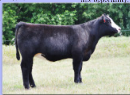
$6,000 daughter by Unforgiven

Selling choice of 3 embryos by either Monopoly or Unforgiven. Seller guarantees one pregnancy if work is done by a certified embryologist.