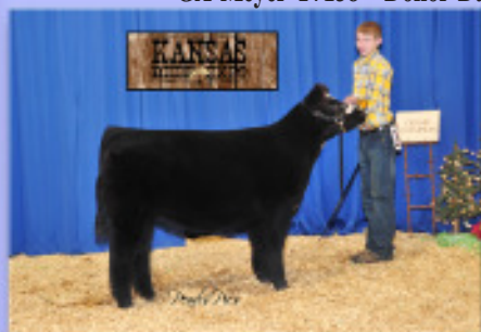
$14,500 daughter by Monopoly