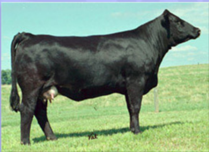
Triple C Go Girl K34G - Dam of Triple C American Girl N07J

Selling choice of 3 embryos by either Monopoly or Unforgiven. Seller guarantees one pregnancy if work is done by a certified embryologist.