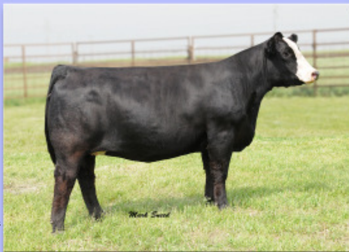
GA Miss Macho 954W - Donor Dam of Lot 47