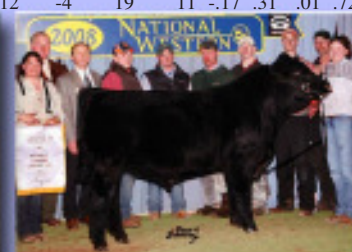
Triple C Power Dozer Full Brother to Triple C American Girl