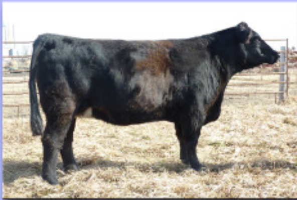
AJE/JF Joys Symphony - Lot 40