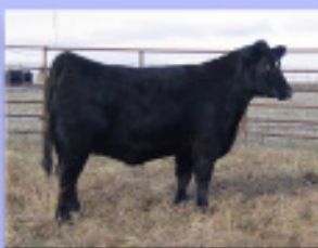
GA 028X - Full Sib to Embryos Selling as Lot 69