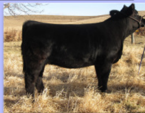
Juncks 46Y - Lot 122

Powerful describes Tulip who is a maternal sister to the heifer we sold here last year "Lilly" who was the high selling open heifer. Her sire was a black baldy son of 3C Macho, and her dam is out of RBS Hot Shot we bought at this sale. Tulip puts it all together just as "Lilly" did and has "mamma cow" written all over her.