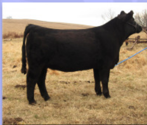
Juncks 45Y - Lot 115

Powerhouse star headed open heifer. She has enough look to make a show heifer and enough power and performance to be a great cow.