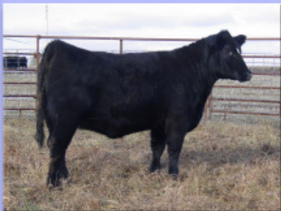
GA Miss Macho 028X - Lot 69