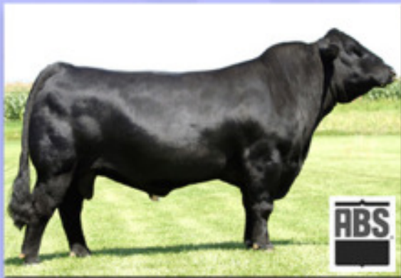
CNS Dream On - Paternal Grand sire of Lot 5

Here is a nice deep bodied black bull with lots of depth of rib. This bull is an easy keeping kind of bull. He will handle a lot of cows with his age. Look him up on sale day.