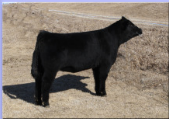
KCC 6Y - Lot 114

This solid black, big boned, goosey fronted cow always produces one of my top selling show calves. They are hairy and extremely attractive. Her smokey Troubadour calf could be your next big time calf. Pregel safe to AI date.