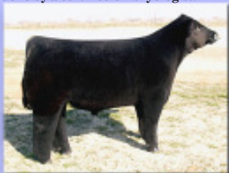
Monopoly - Sire of Lot 47

Selling choice of 3 or 5 embryos. Seller guarantees 1 pregnancy out of 3 or 2 pregnancies out of 5 if work is done by a certified embryologist.