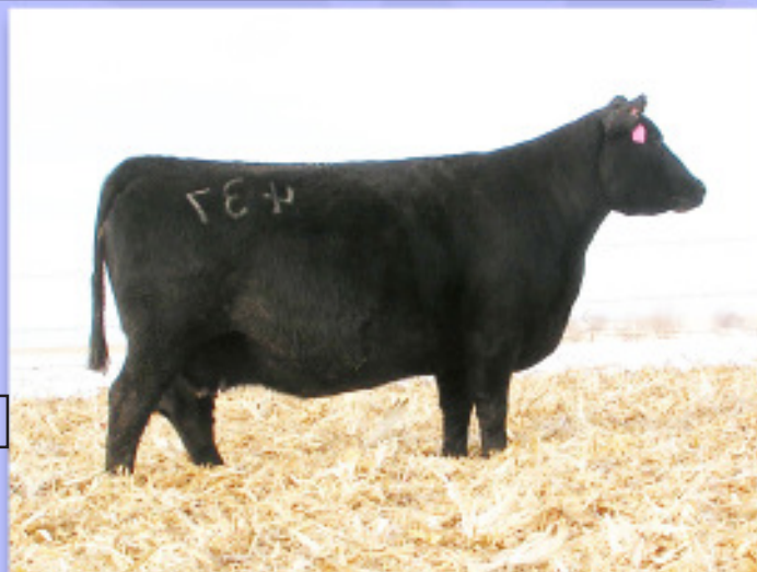
Jauer Laredo 930 437 - Donor Dam of Lot 48

Selling choice of 3 or 5 embryos. Seller guarantees 1 pregnancy out of 3 or 2 pregnancies out of 5 if work is done by a certified embryologist.