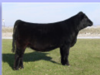
GA American Girl 007 Champ. Sim. Female Midwest Classic