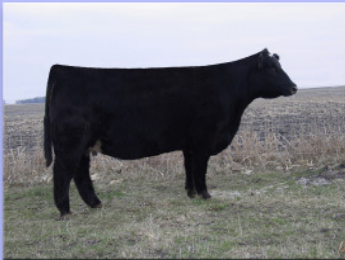
GA Meyer T7138 - Donor Dam of Lot 45