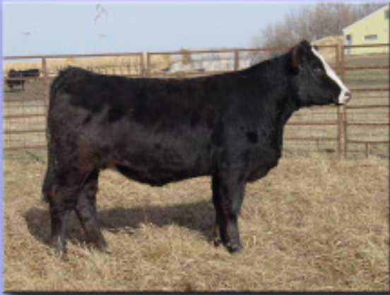
GA Brandy 015X - Lot 51

This is our first calf crop using Chopper and we're certainly not disappointed. If you are looking for a purebred cow to put in the front pasture, don't overlook this eye appealing Chopper daughter. She's got excellent spring of rib with a very feminine shoulder and neck. Her granddam is Jeff's H816 donor that has produced some of the best females we've ever had. Safe to In Dew Time. No cleanup bull.