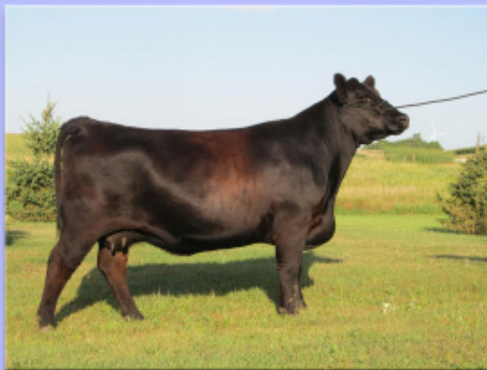
Lazy H Bar Forever Lady 7190 - Donor Dam of Lot 43

Selling 3 embryos. Seller guarantees one pregnancy if implantation is performed by a certified embryologist.