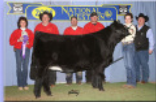
Ant Joys Cashmere