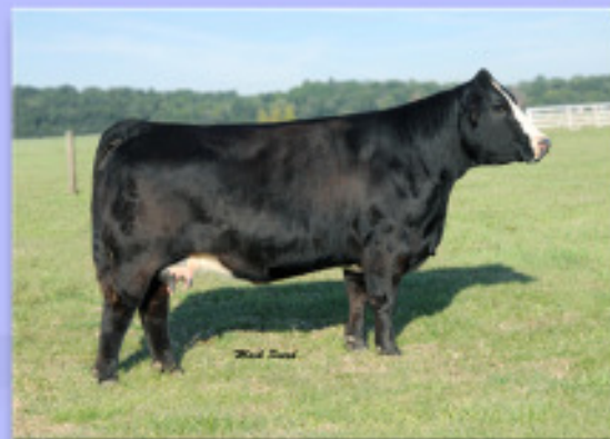
Double R She's The One K18 - Granddam of Lot 119

Here is an opportunity to purchase a granddaughter of Ruby Cattle Co./K18 Group's cow Double R She's The One K18. K18 commanded $22,500 for half interest at The One Simmental Sale at the National Western Stock Show 2010. This cow family has produced a lot of good progeny for Ruby Cattle Co. Y124's dam is out of In Dew Time which has really clicked with K18.