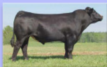
3C Macho M450 BZ - Sire of Lot 44