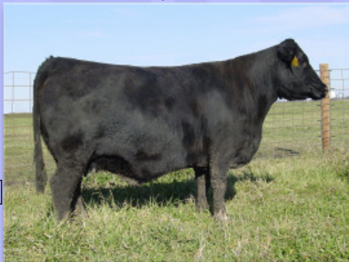
SA 1119 Emblazon 433 427 - Donor Dam of Lot 44

Selling choice of 3 or 5 embryos. Seller guarantees one pregnancy out of 3 or 2 pregnancies out of 5 if work is done by a certified embryologist.