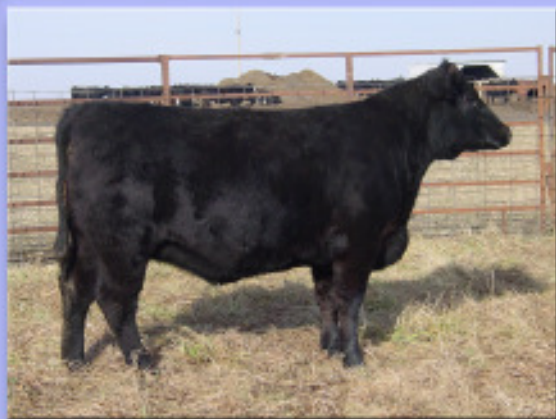
GA Primrose Lady 062X - Lot 60