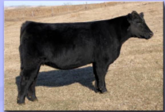
KCC 51X - Lot 74