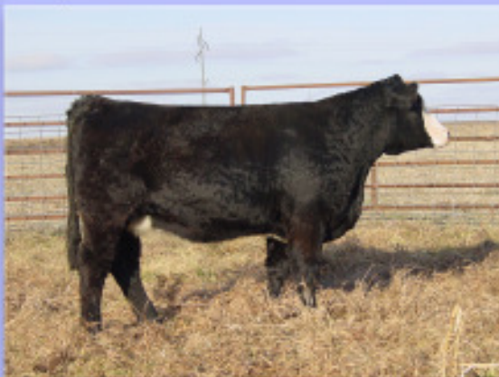
GA Miss Sure Bet 024X - Lot 54

DC5X is a purebred black bred heifer. She is bred to the Nichols Manifest T79 sire. Manifest produces easy birth calves with the potential to grow quickly.