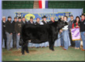
AJE/JF Ant Joys Elegance