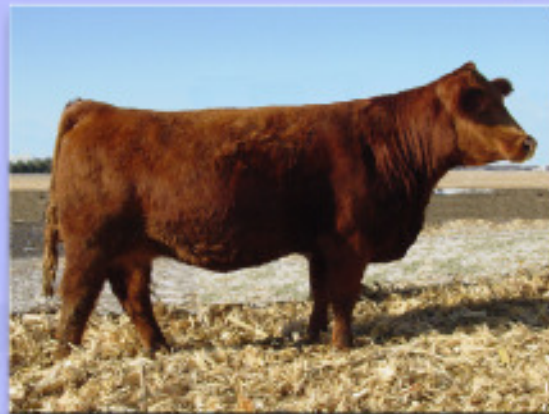
GA Faith 719T - Dam of Lot 85

Consignor: Golden Acres Simmental Crossbred Bred Heifer ASA# 2551646 Tattoo: 020X BD: 4-12-10