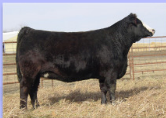
GA Miss Meyer 019X - Lot 65

Miss GX 728R WK Gunsmoke WK Arkdale Pride 255