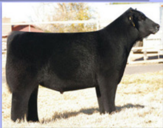
Dirty Hairy 2 - Service sire of Lot 58

This baldy heifer will please the most particular buyer. She's neat about her neck and shoulders and has a deep rib and level hip. She's got all the style to be a great clubby mama or will fit in any Simmie program. Her mother is a Meyer 734 daughter so expect some fancy calves. No clean up bull.