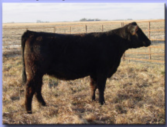
GA/R&K Ms Crush 076X - Lot 63

This Meyer 734 daughter is as full sister to the high selling female at last year's sale. This heifer is a diamond in the rough considering her recip mother died 2 weeks after calving, so 051X was raised as an orphan. Any cowman knows what that does to the phenotype of a calf. The genetics are there so buy this heifer with confidence that she'll raise the great ones. No clean up bull.