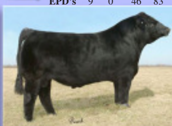
Triple C Positive Power Full Brother to Triple C American Girl