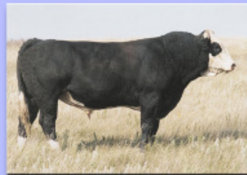
Meyer Ranch 734 - Sire of Lot 48