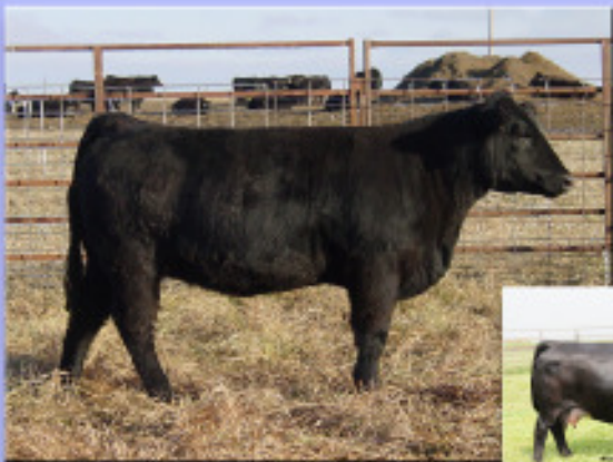
GA Ginger 060X - Lot 79