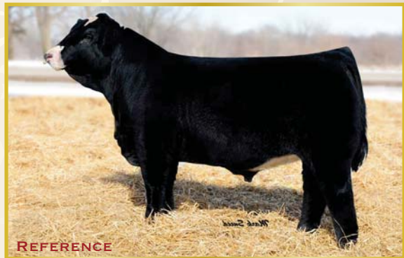
JASS/JS OPTIMIZR 58X SIRE TO LOT 136

Here is a star headed, halfblood heifer that Jason had to twist my arm to sell. Her Angus dam is a top young cow we selected from the Triple B Knoll Ranch dispersal in NE. She combines moderate frame & femininity with the growth & carcass traits of our Optimizer 58X bull. WW EPD in the top 15% of the breed, YW in the top 15%, Marbling in the top 20%, API in the top 30%, TI in the top 15%. She certainly could be fun on the end of a halter for a junior, but knowing the pedigree she should really shine in the pasture whether you are raising seedstock or selling calves by the pound!