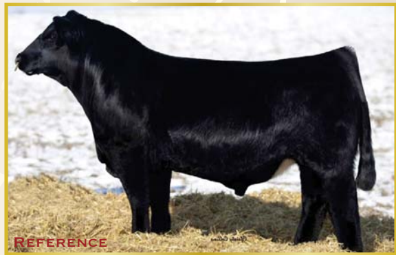
RUBYS WIDE OPEN 909W SIRE TO LOT 135

Good looking, smooth made blaze faced Wide Open heifer out of a stout made half blood SimAngus cow. These Wide Open heifers make great cows. Take advantage of the opportunity.