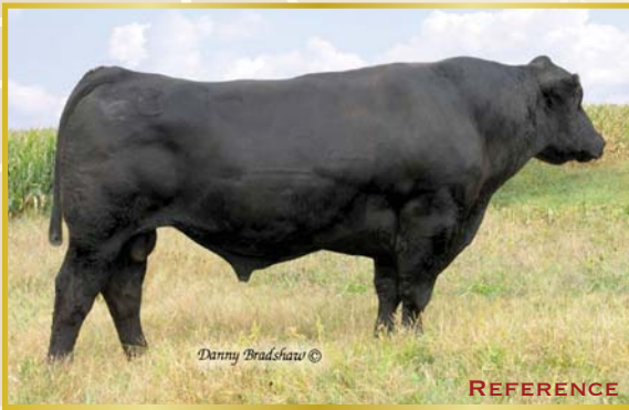
Danny Bradshaw ©