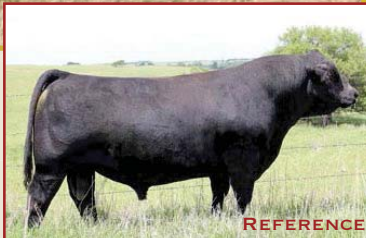
WS PILGRIM SIRE TO LOT 110B - EMBRYOS