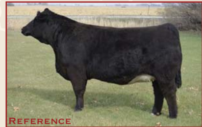
AMERICAN GIRL DAUGHTER