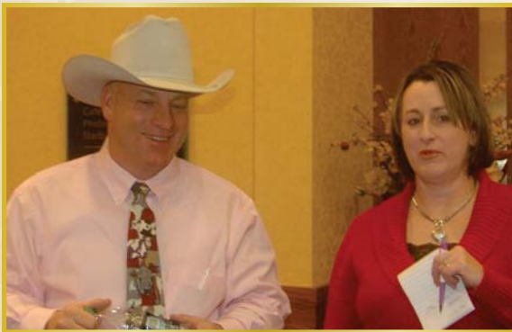
2014 SIMMENTAL BANQUET

Named after a good friend who has done four tours, STH Major Lovett makes us proud just like his namesake! An American Pride son out of our really good DBE Ruby Tuesday cow, he's got power and style galore! Be sure to check him out, you won't be disappointed.