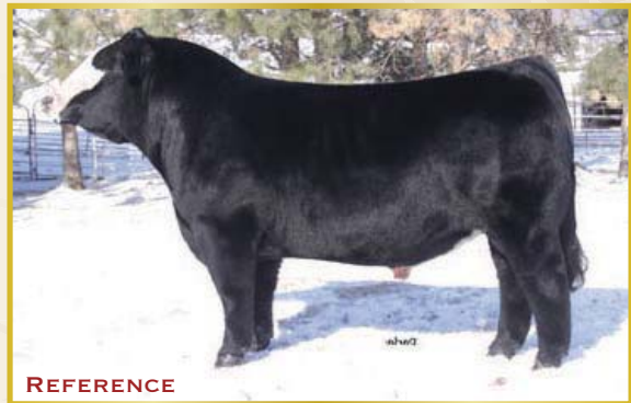
MR HOC BROKER SIRE TO LOT 137