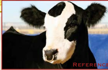
TLLC ONE EYED JACK EMBRYOS/PREGNANCY SIRE