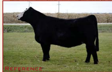
GA R&K MANDI 354A DAUGHTER TO LOT 113