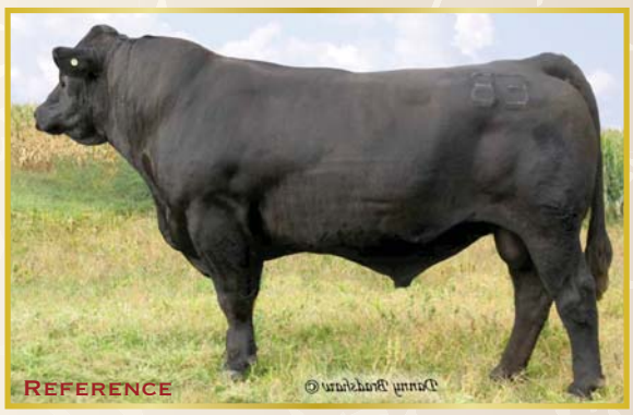
GW RIGHT PATTERN 602Y SIRE TO LOT 50

38B started a little big, but when used on cows you should expect him to produce a lot of weight, a lot of muscle, a lot of length and not much air between their bellies and the ground.