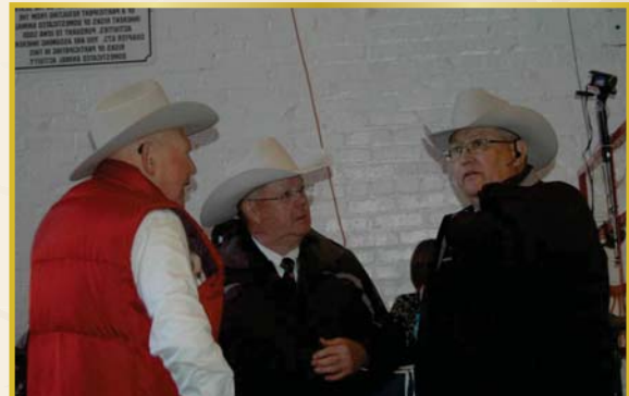
2014 MARK OF GENETIC EXCELLENCE SALE

Cason's Miss Terra is a solid black Cason's Mr. Cartwright daughter that has done extremely well; she is feminine fronted with a ton of rib shape. This is our second calf crop by Cartwright and we are very pleased. Miss Terra gets better every day and I think she has a bright future as a show heifer and a highly productive cow.