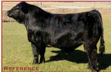
AMERICAN GIRL SON