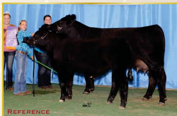
CASON'S MISS DAISY MAY DAM TO LOT 58