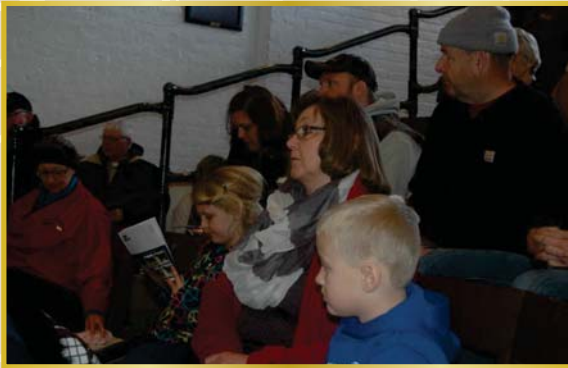
2014 MARK OF GENETIC EXCELLENCE SALE