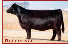
DAM TO LOT 81