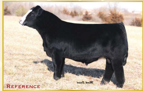
LLSF UPRISING Z925 SIRE TO LOT 143

The Uprising females are rapidly proving to be highly sought after. This female is no different, she is huge middled, great spring to her rib and really easy doing. Very good in her structure and can get out and move freely. A lot of cow power back up this female. Half maternal sister to the $9000 bull sold in the 2014 IA Beef Expo Sale.