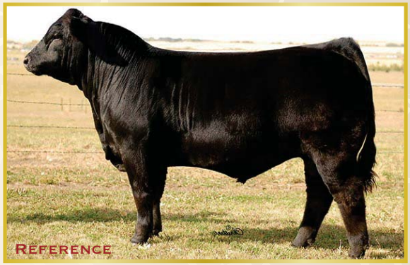
NEW TREND WAY COOL 6W SIRE TO LOT 26

A tremendously thick, deep made calf, that is one of the most complete we have ever brought to EXPO. Sired by the Hart bull WAY COOL and out of our excellent UPTOWN GIRL donor, who is a 600U granddaughter. UPTOWN GIRL had an excellent show ring career for the Grass boys in Minnesota, winning several shows, and being selected reserve champion at the state fair FFA show.