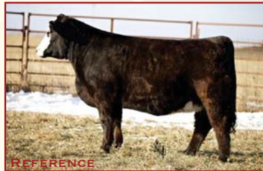
AMERICAN GIRL DAUGHTER