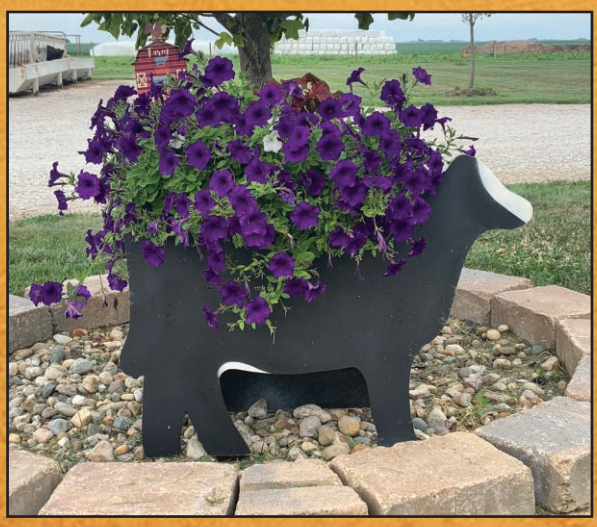
(To be sold at Cattlemens Choice sale in Arthur)