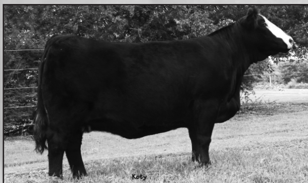
DAF Summer Z65 Progency