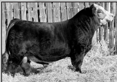
REFERENCE SIRE: FELT LAST CALL 304F